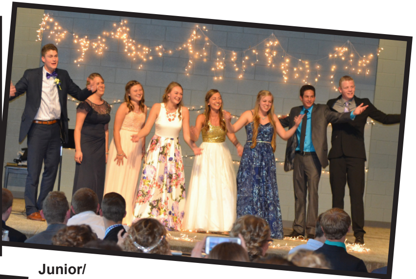
Junior/ Senior Banquet